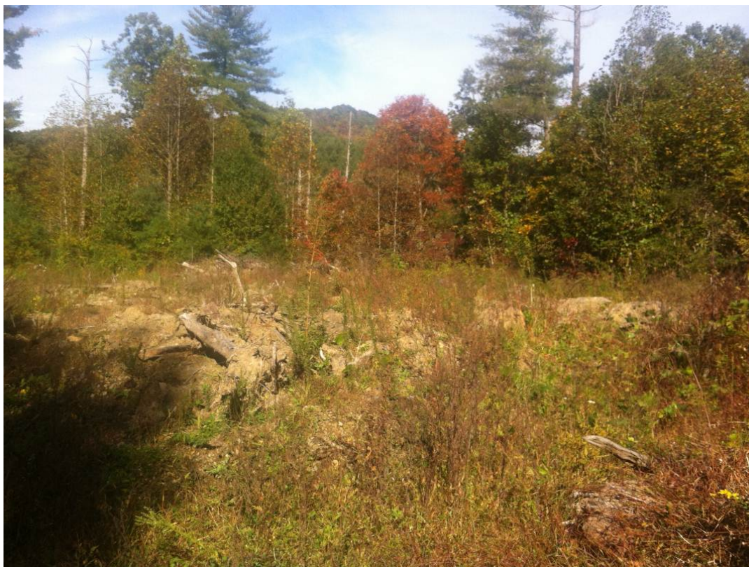
Dumping site looking north toward site