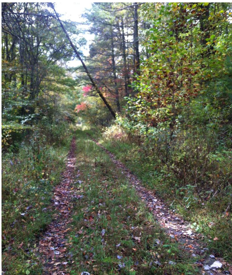
Northern trail site boundary looking west