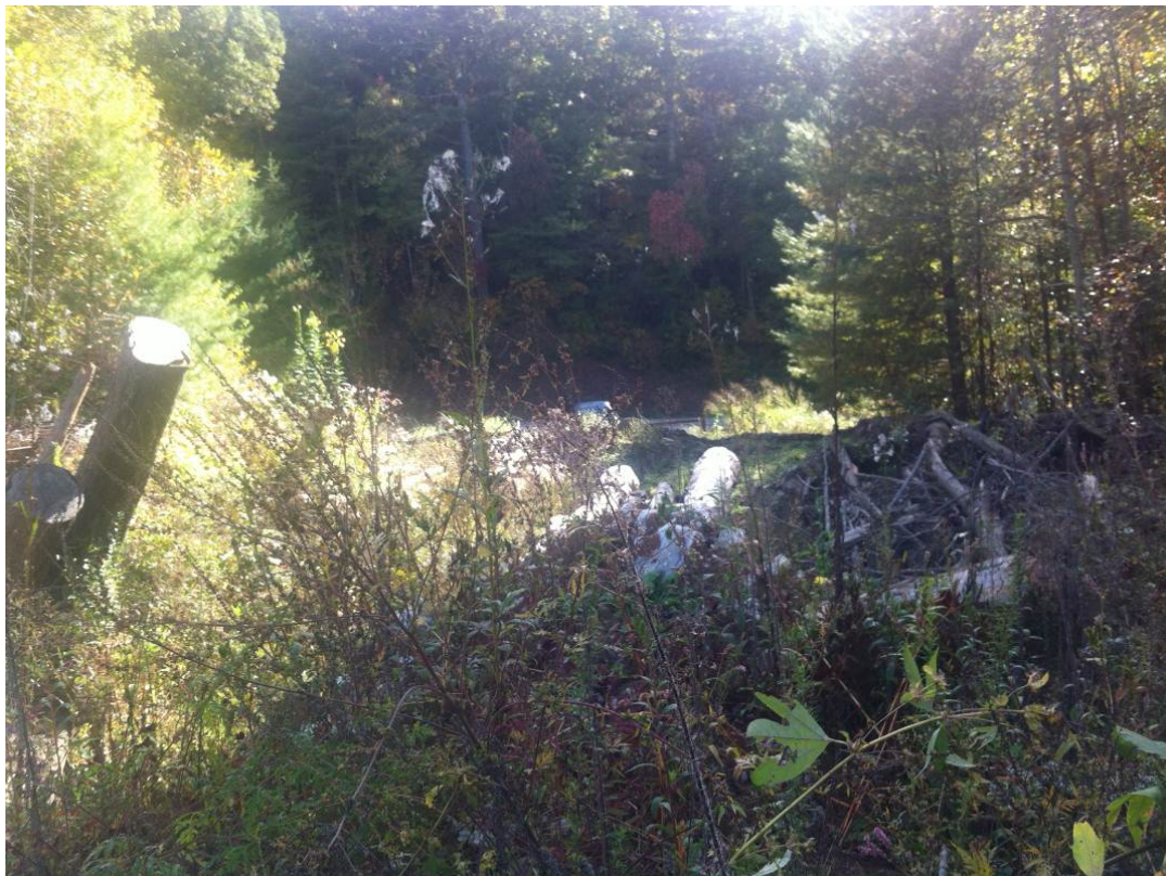
Dumping site looking toward Tallulah Road