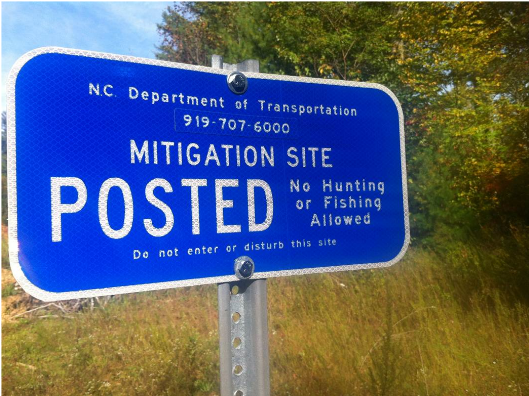
New 2012 signs added along Tallulah Road