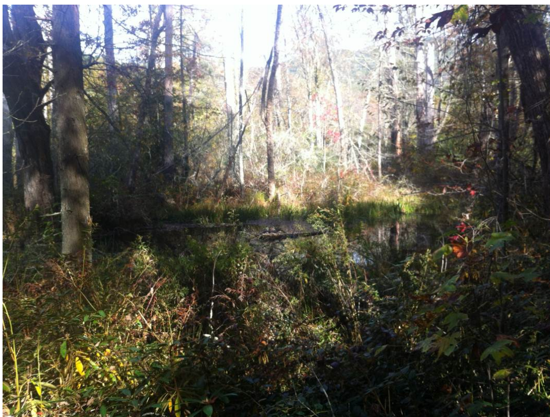
Tulula bog area nearby dumping site